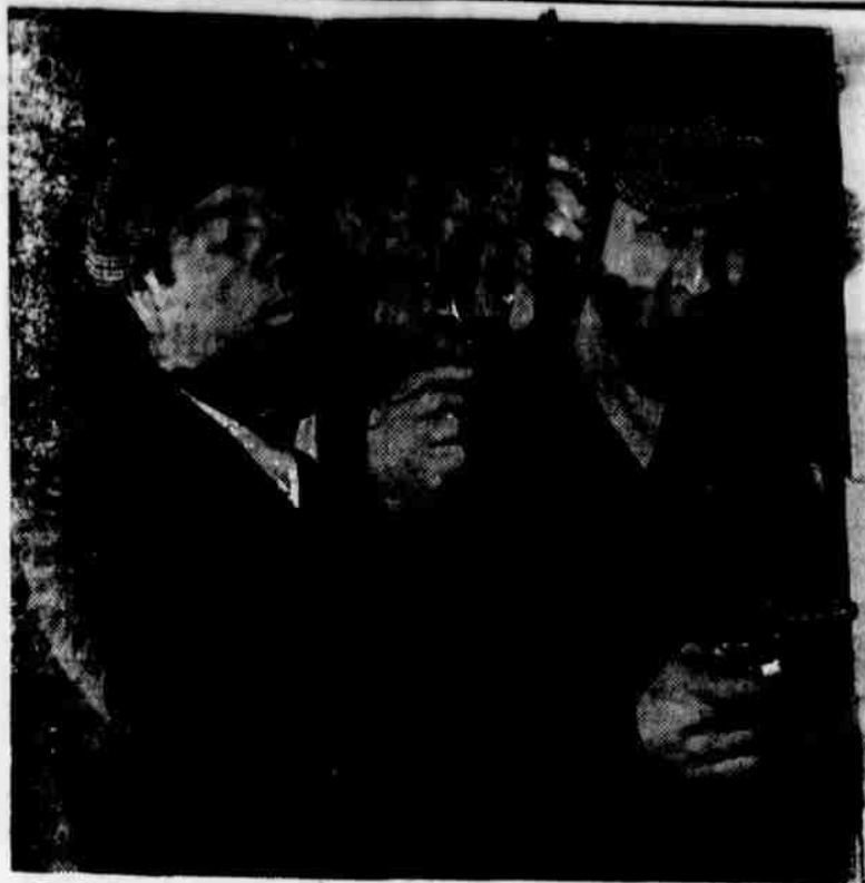
MAY BE A CLUE HERE—Lou Costello carefully examines Bud Abbott's ear in true Sherlock Holmes fashion, in the uproarious comedy-mystery, "Who Done It" at the Sky-Vue Sunday and Monday.