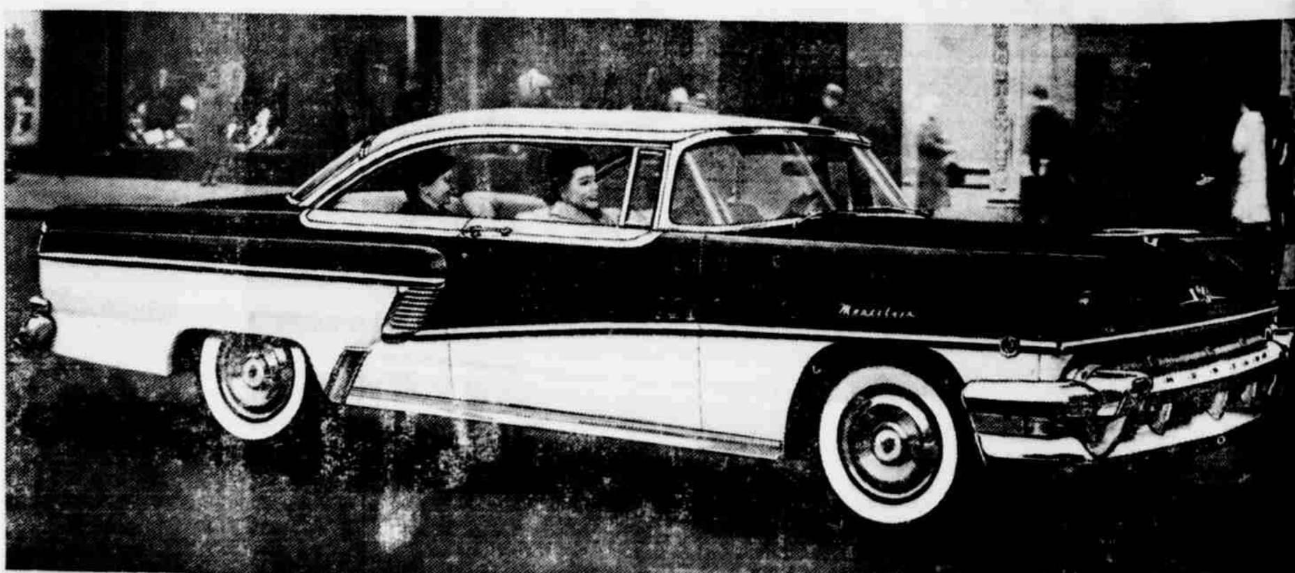
The stunning Mercury Montclair 2-door hardtop with distinctive low profile and Flo-Tone color styling.

Easier riding and handling on sharp turns — new comfort on bumpy roads — widest choice of safety features in its field help explain why THE BIG M is the big buy for 1956.