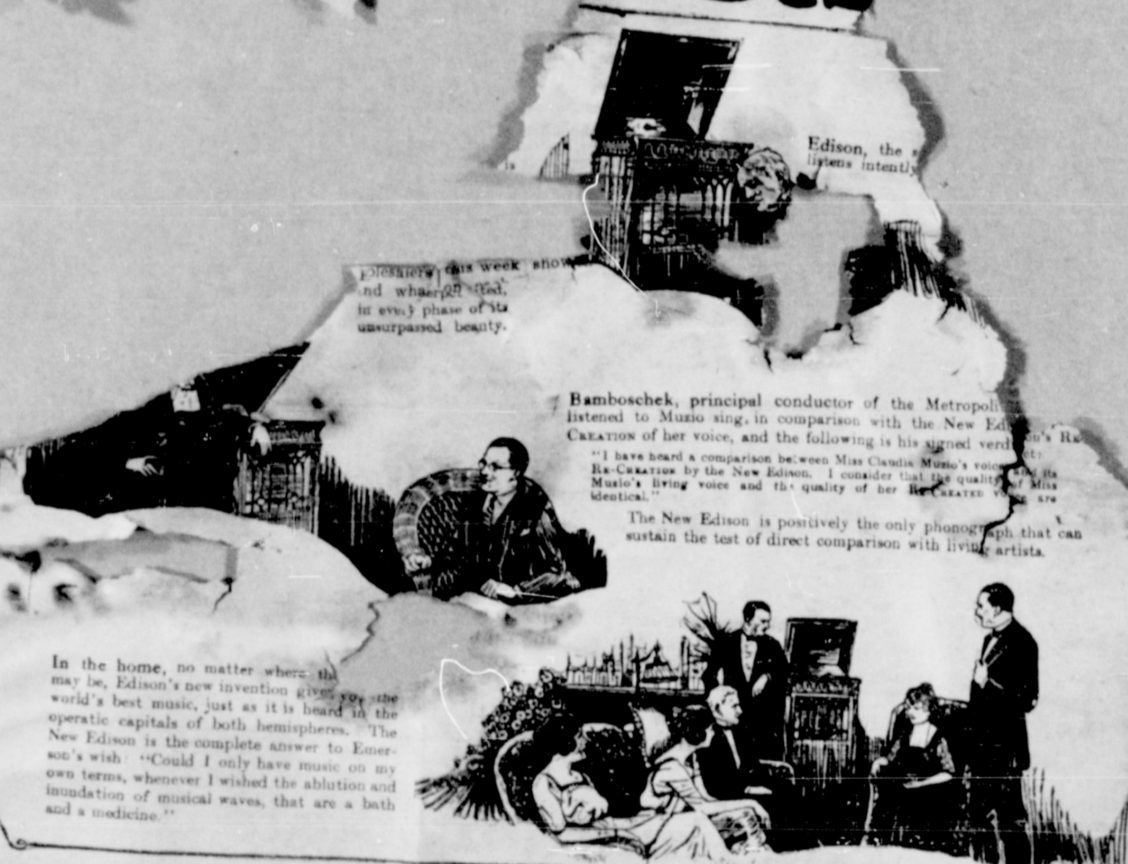
Edison, the listens intently

...this week show and wh... in every phase of its unsurpassed beauty.