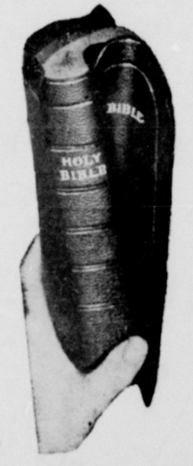
WE SPEAK WHERE THE BIBLE SPEAKS AND ARE SILENT WHERE IT IS SILENT