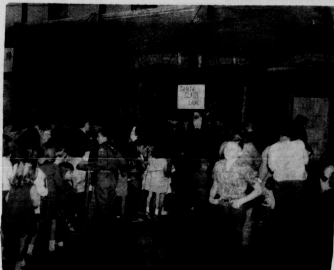
At K C Chamber Santa Event

Knox City area children line up in Santa Claus Lane to speak to Santa at the downtown event held here on December 19 under the sponsorship of the Knox City Chamber of Commerce. The successful program drew a large crowd. Children were handed Christmas bags of fruits and candy.