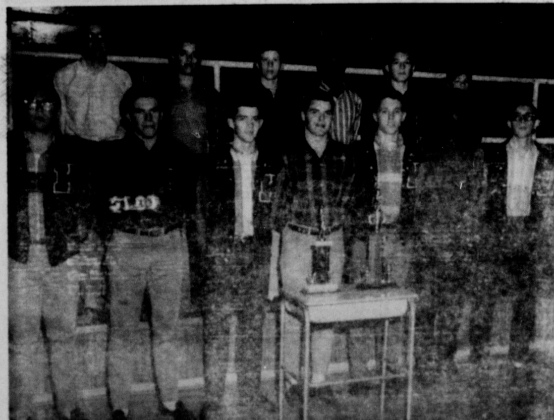
Boys' Team Presents Trophies

All members are urged to be present for this meeting.