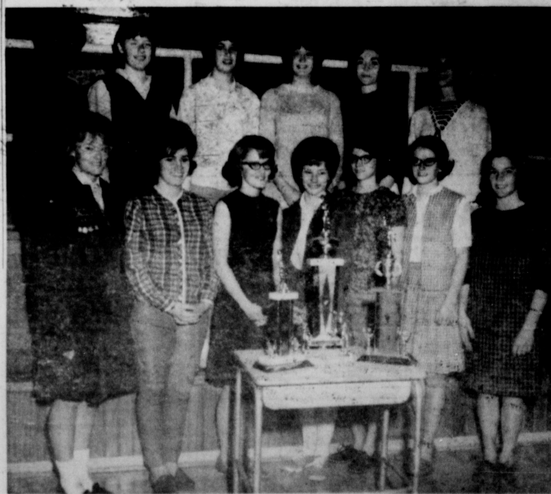
More Trophies For K. C. School