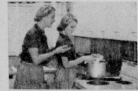
The deep-well cooker has many uses, not only for meals—but many other things—to make large quantities of coffee or cocoa at party time, to sterilize baby's bottles—and even to pop corn!

DID YOU KNOW with an Electric Range you can: Keep foods warm for long periods on low, gentle heat of surface units... prepare jams and preserves under broiler unit... use controlled, measured heat to cook frozen vegetables and fish without water, in aluminum foil on surface units... "prove" yeast dough in warming oven... freshen rolls by wrapping in aluminum foil and placing on surface unit on low heat for a few minutes?