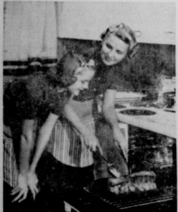
It's so easy to bake, roast or broil with an Electric Range... no flame, less shrinkage of roasts, cleaner cooking, and a cleaner kitchen.