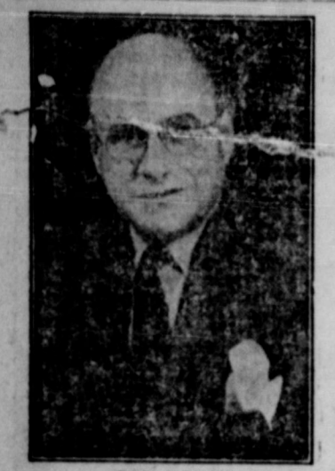
President Continental Oil Company