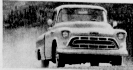
Alcan fleet reports up to 18.17 miles per gallon! That's the mileage reported by the Cameo Carrier, with Thriftmaster 6 and Overdrive (optional at extra cost).

Heavyweight Champs with Triple-Torque tandem are rated at 32,000 lbs. GVW, 50,000 lbs. GCW. Special features include built-in 3-speed power divider.