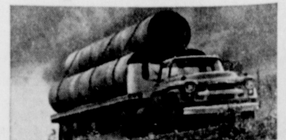
All the way in DRIVE range with Powermatic! This Powermatic-equipped 10000 Series tractor traveled the Alcan Highway in a single forward-speed range!

Only franchised Chevrolet dealers CHEVROLET display this famous trademark