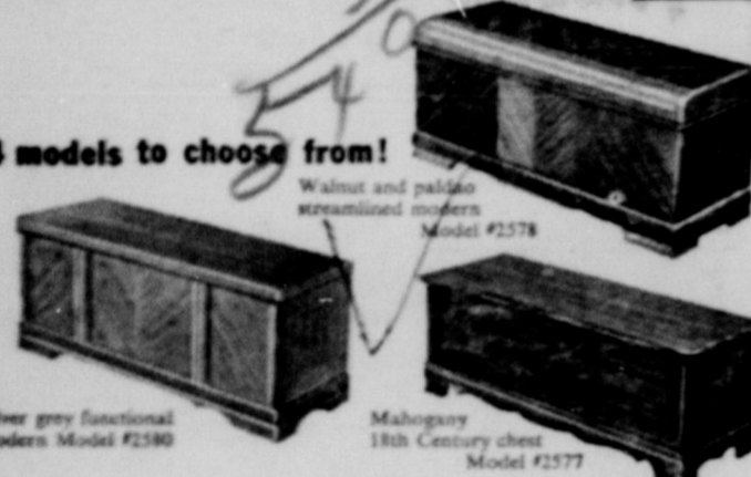
4 models to choose from! Walnut and pale oak streamlined modern Model #2578 Silver grey functional modern Model #2580 Mahogany 18th Century chest Model #2577

Showing modern Lane Chest of 14-inch red cedar with blond oak veneer. Model #2576. Lane Chests are the ONLY pressure-treated, aroma-tight cedar chests—with absolute moth protection guaranteed by one of the largest insurance companies. All Valentine specials have removable, self-rising trays.