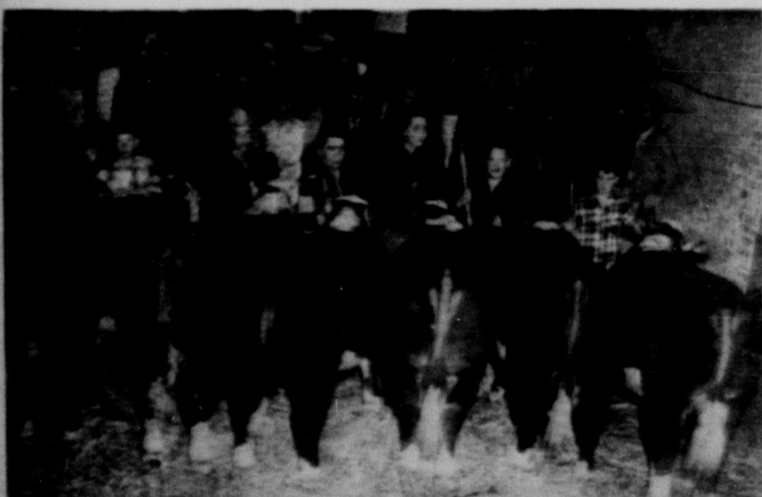
Top Calves in the 1950 Junior Livestock Show at Munday

Knox County 4-H Club and FFA Boys, Parents and Visitors