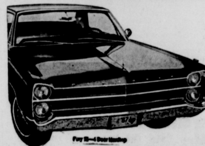
Four 12-4 Durability