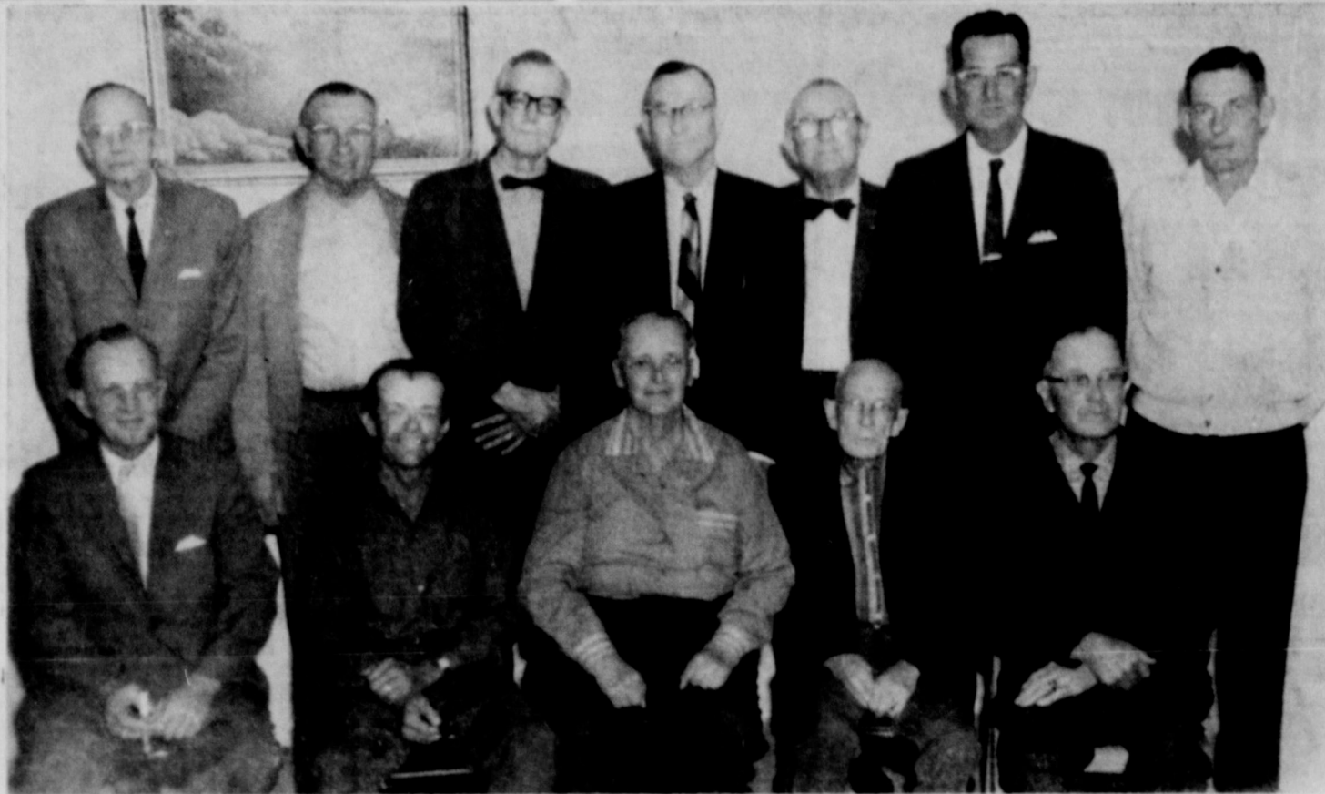
Past Masters, Orient Lodge No. 905