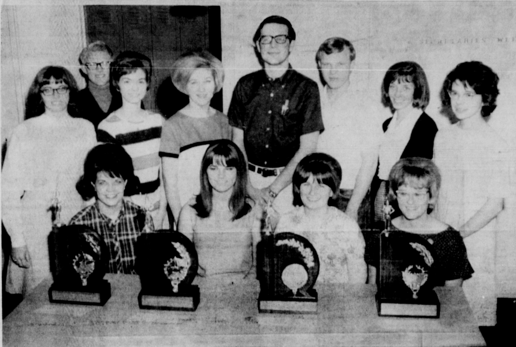
Four Trophies For 4-Ye ars As Sweepstakes Winners