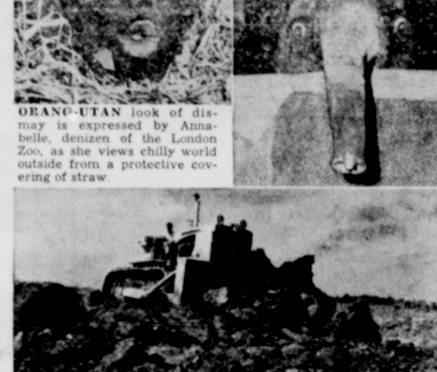
this new International TD-25 crawler tractor, load of earth on runway extension project at

Send Santa Letters to The Heraid so they money fer that project. As long will appear in the big