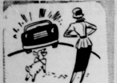
Mary had a little car Two old and rusty, too She took it home To her Ford man And now it looks like new!