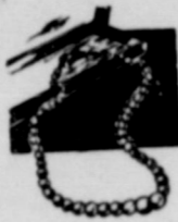
Necklace, Hair Comb Ear Rings, or Pin . . .

The young girl graduate will be delighted with a