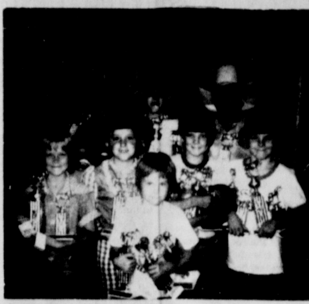
LOADED WITH TROPHIES are these playnight winners following the last playnight of the season at the Knox County Riding Club in Benjamin last Saturday night.