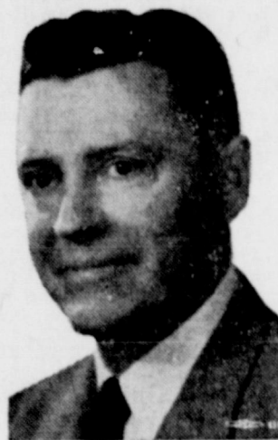
Pol. Adv. pd. for by Knox City Friends of Ralph Yarborough

Carried his Home County, Henderson County in EAST TEXAS, 3 to 1 over his opponent who did not carry his own home county.