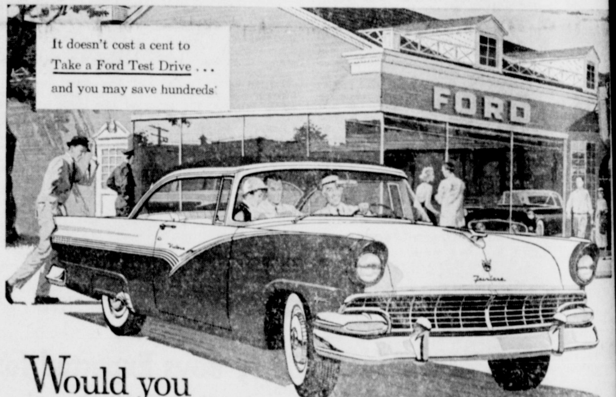
August is Saving Season at your Ford Dealer's. Bag a deal while he clears his decks for the '57 models.

It doesn't cost a cent to Take a Ford Test Drive . . . and you may save hundreds!