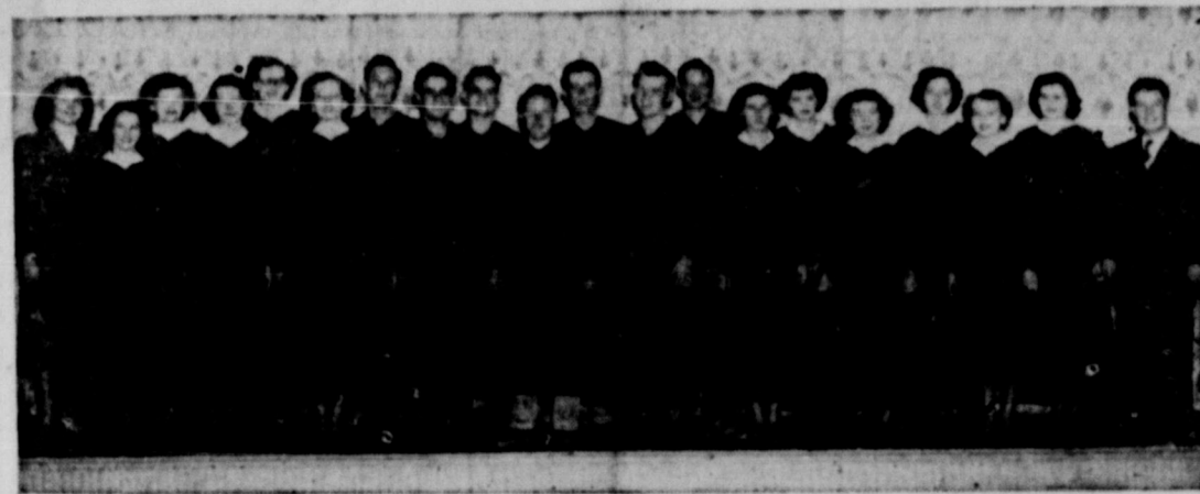
This group from Decatur Baptist College will be presented in a variety program at the local Baptist Church Wednesday night, May 7, at 8:00 p. m. The public is invited to attend and hear the choir's program of anthems, hymns and secular songs.

The Eleventh Court of Civil Appeals at Eastland last week overruled the Munday School District's motion for a rehearing of the case titled Munday Independent School District vs. Knox City Independent School District, et al, in which the court recently ruled in favor of Knox City.