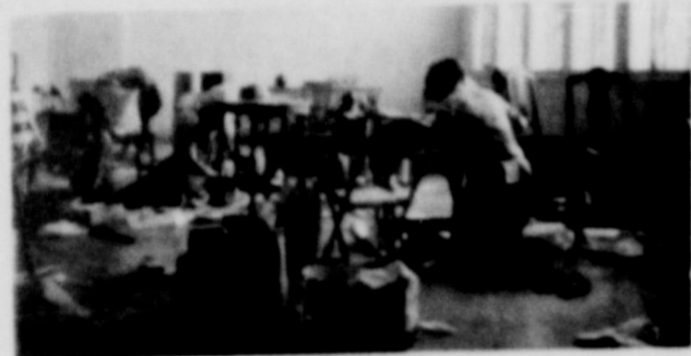
WOMEN AT TRUSCOTT workshop as they work on refinishing their furniture.