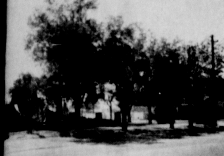
REMAINED TWO HOURS AFTER THE BLAZE - The framework pictured above is continued to smolder for several days afterwards.