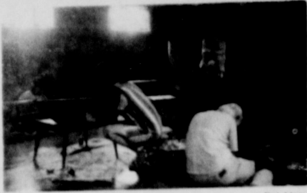
WOMEN AT KNOX CITY Workshop as they work on refinishing their furniture.