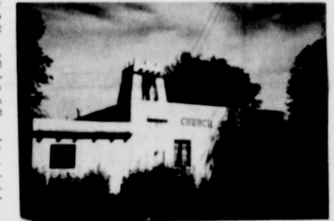
TAOS CHURCH OF CHRIST