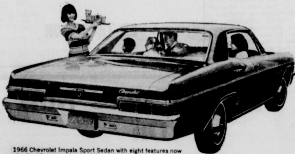
1966 Chevrolet Impala Sport Sedan with eight features now standard for your added safety—including back-up lights and seat belts front and rear (always buckle up!)

What you get is • The meticulous coachwork of Body by Fisher that surrounds you with rich appointments, deep-twist carpeting • Full Coil suspension that uncinkles roads • Magic-Mirror finish • Gobs of room for hips, legs and feet. What you can add includes • Comforton automatic heating and air conditioning—spring weather the year round • AM-FM multiplex stereo radio • Tilt-telescopic steering • Power everything—brakes, windows, seats, steering.