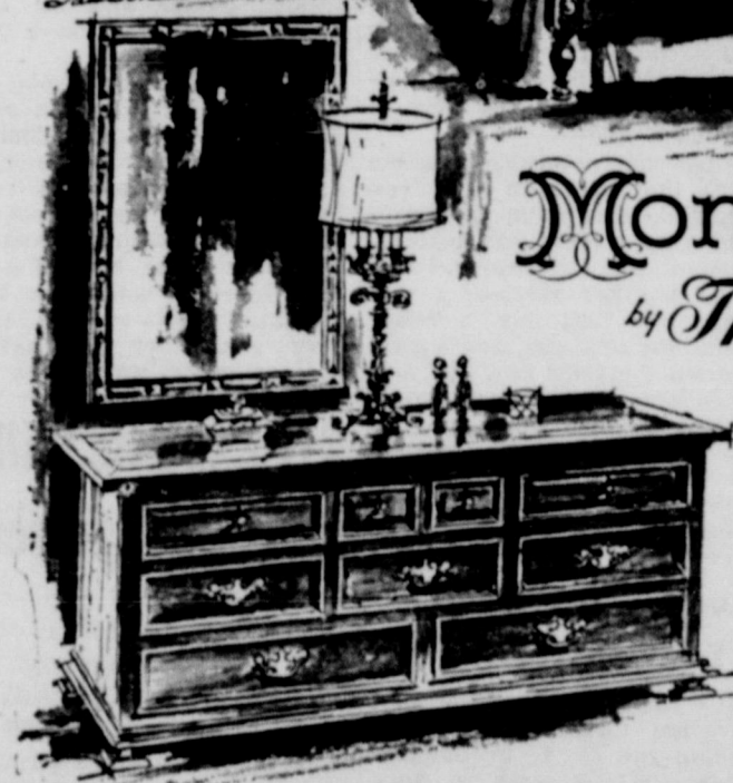
Below, low go-together chests: one with doors, the other with drawers . . . a bonanza for the bedroom, equally wonderful in your foyer or living room.

Siesta, deep sleep, or just plain get-away-from-it-all . . . you'll find it more refreshing in your new Monterey bedroom.