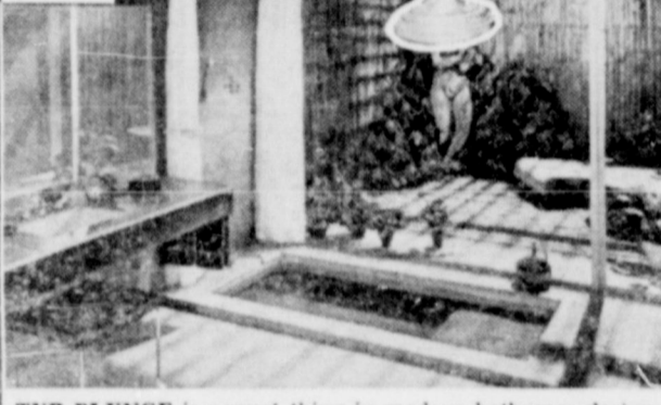
TUB PLUNGE is newest thing in modern bathroom design. Here famed architect Edward Stone has used waterproof ceramic tile for the "plunge" to fulfill design theme of the deluxe bath.