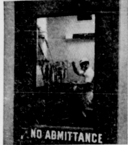
This technician is filtering dead cells and all other foreign matter from polio virus after it has grown on animal tissue in glass containers.

For the first time in history, a vaccine is protecting millions of human beings from paralytic polio. While the Salk vaccine will not work in every case, American children are being safeguarded against the dread disease, with no more risk than they would take in a vaccination against smallpox or a typhoid shot. The Salk vaccine must pass elaborate tests under the watchful eye of a government inspector at every stage of production. Then the final packaged vaccine is approved by the U.S. Public Health Service for distribution. Here are shown a few of the steps that assure American parents their children are being given a safe vaccine.