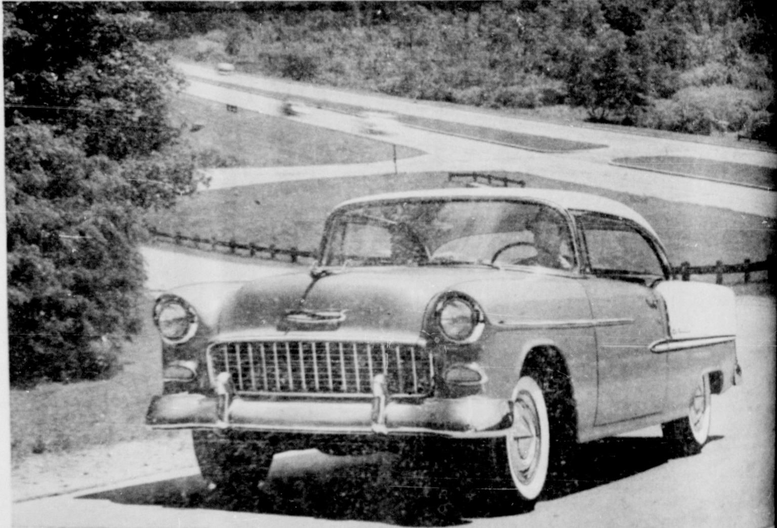
Great Features back up Chevrolet Performance: Body by Fisher—Ball-Race Steering—Outrigger Rear Springs—Anti-Dive Braking—12-Volt Electrical System—Nine Engine-Drive Choices.

The new Chevrolet has proved itself all K-I-N-G in today's toughest driving competition!