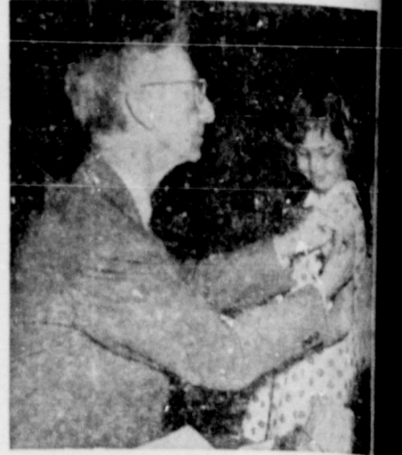
It's all over and it didn't hurt a bit! Salk vaccine makes this little girl safer now from paralytic polio. And her parents feel better too.