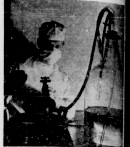
Virus is "cooked" in tank with formaldehyde (from bottle) until it is rendered harmless, after which it must pass exacting safety tests.