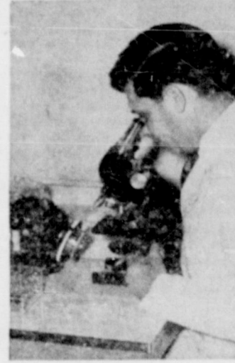
This expert is examining tissue after contact with vaccine, to determine absence of live virus.