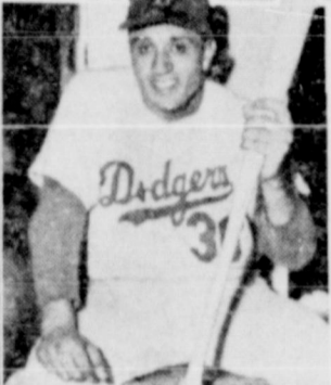
BIG GUN of Dodgers, Don Newcombe, had 18 wins in his first 19 decisions and had tied record for home runs by pitchers.