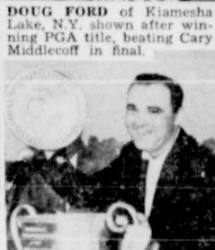
DOUG FORD of Kiamesha Lake, N.Y. shown after winning PGA title, beating Cary Middlecoff in final.