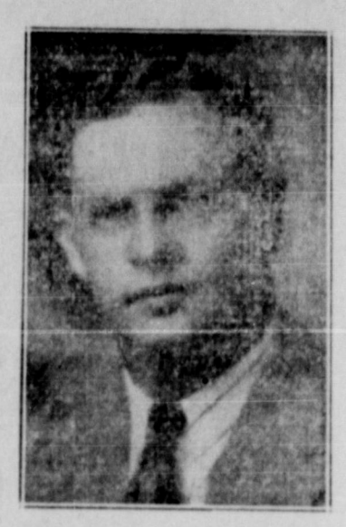
Candidate For COUNTY SUPERINTENDENT

If elected, my aim is to serve SCHOOL, CHIL-DREN, TEACHERS, and COMMUNITY to the best interest of ALL CONCERNED.