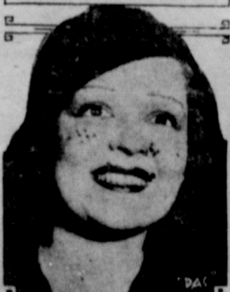
An informal picture of Clara Bow, red-headed "IT" girl of the movies, photographed as she sailed for Europe on a vacation with her husband, Rex Bell, movie cowboy.