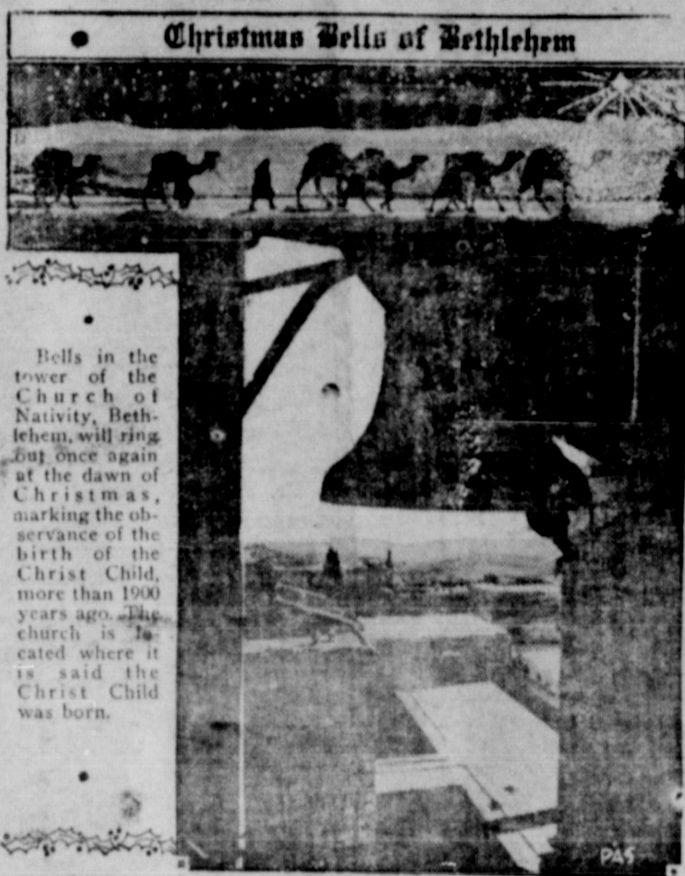
Bells in the tower of the Church of Nativity, Bethlehem, will ring out once again at the dawn of Christmas, marking the observance of the birth of the Christ Child, more than 1900 years ago. The church is located where it is said the Christ Child was born.