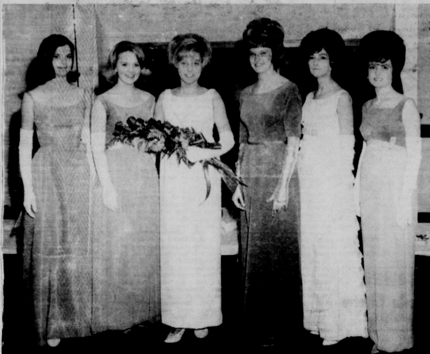
Candidates Competing for Sweetheart Title During Knox Co. Livestock Show

No Rainfall this week Soil (bare groud) 31 1-24 52