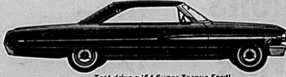
Test-drive a '64 Super Torque Ford!

Take the wheel of a '64 Ford and discover a new breed of ride, ruggedness and response that will convince you better than any words we might say. Enjoy a few delicious moments of truth... today!