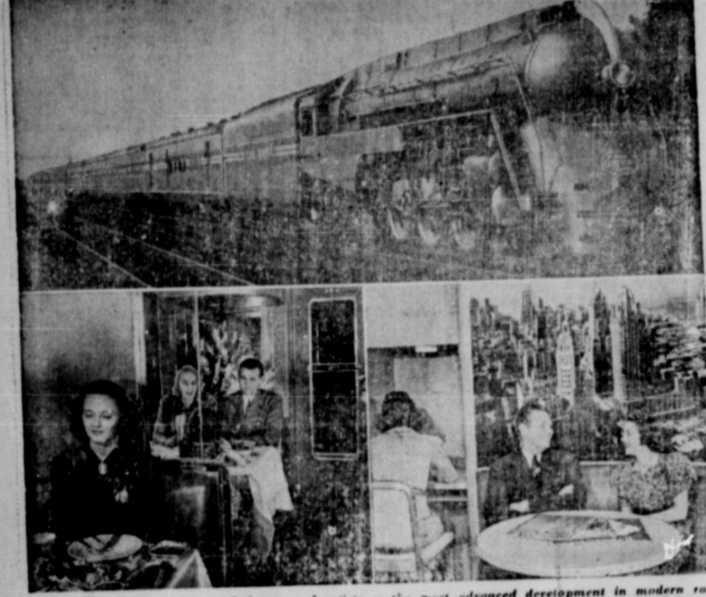
Acclaimed by engineers, designers and artists as the most advanced development in modern rail transportation, the new Twentieth Century Limited of the New York Central's "super-luxury train," in two sections each way, went into service between New York and Chicago on a time impulse sent to each terminal by special wire from the Elgin Observatory. This famous train is now on the fastest all-room train in America. It was designed by the architect of the modernistic dining car and, at right, end of one section with photomural of Chicago on hand woven cloth.