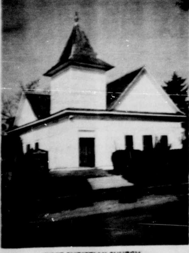
FIRST CHRISTIAN CHURCH...Building built in 1908

Instruction Classes conducted through-out on Tuesday openings from 8:00 a.m. to 1:00 p.m. Instruction offered at School, Goree and Knox City. Enrollment at the course of instruction on an individual basis. There is no number that can be at least have with school. There is tuition and furnished. Offered in Basic preparatory work, E.D. certificate, Science, Social Science, Math, English. Classes in English as a subject when there is information. Contact the principal's office.