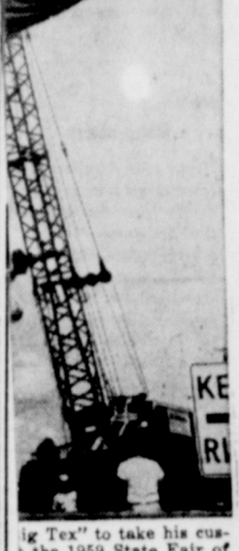
ig Tex" to take his cus-t the 1959 State Fair of g fellow's head is shown ands 52 feet tall.