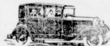
New Fordor Sedan $625 (F.O.B. Detroit)