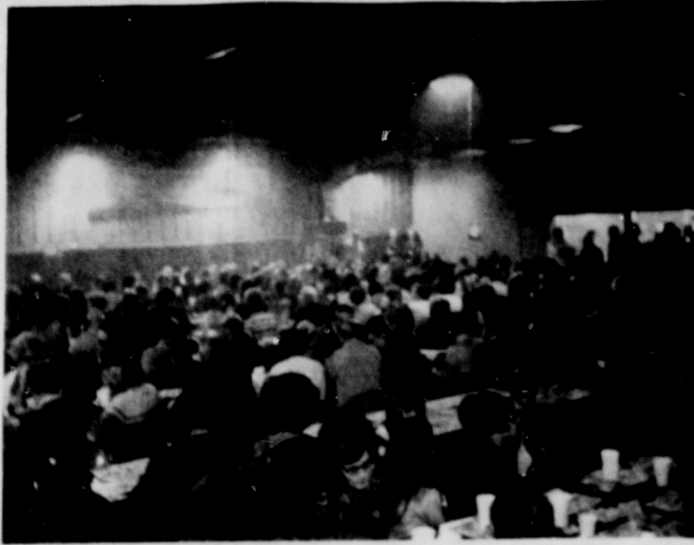
ONLY A PORTION of the crowd attending the fish fry here last Thursday night are pictured above.