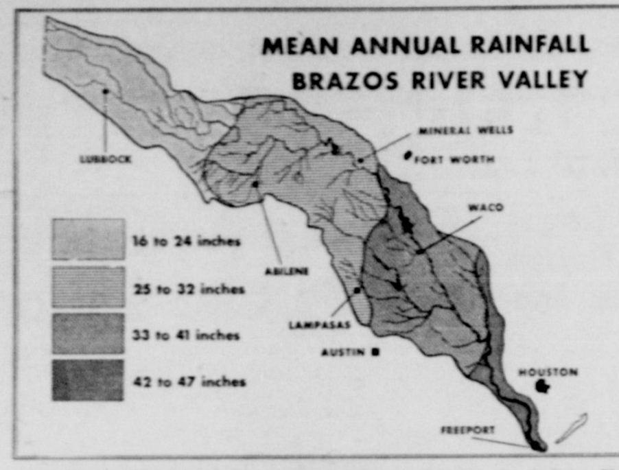
RAINFALL ZONES on this map of the Brazos River watershed show why the Brazos River Authority wants to build new dams in the upper and central portions of the basin as well as in the lower reaches. Rainfall diminishes tast from the Houston area going westward. But all areas of the Brazos Valley, even in the central areas, have a vast potential for municipal, industrial and farm growth—if they can save their limited supply of water that now runs wastefully to the Gulf. Likewise, dams in these areas will save water that can be released for users downstream. Many of these projects would also help control floods. The best reservoir sites are in areas of leaser rainfall. Storing the water can spread the time of use. The Brazos River Authority's engineers have weighed all possible dam sites, as well as local needs throughout the watershed, in planning the river's development.