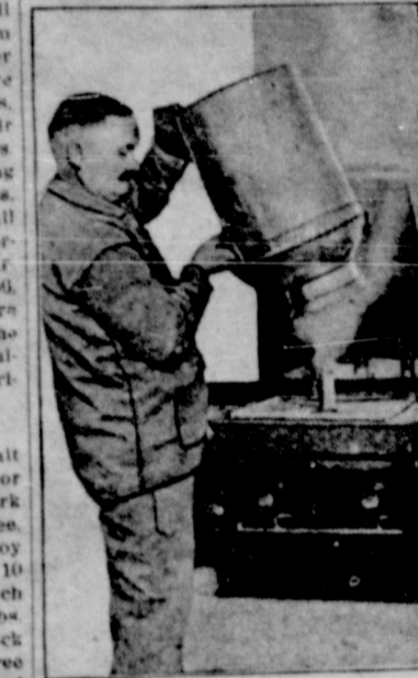
Sterilizing Dairy Utensils is an Im- portant Factor in Keeping Milk Sweet.

The milk can has the same relation to the wholesale trade as the milk bottle has to the retail trade, and it is just as important that it be washed immediately after being emptied, says the United States Department of Agriculture. Milk dealers have appli-