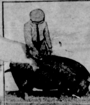
A Pig Club Boy Preparing His Prize Winner for the Show Ring.

These boys and girls did not wait until ready to go to high school or college before starting their club work and savings. Some began two, three, or more years before, or, as one boy said, as soon as he could, meaning 10 years—the youngest age at which children are admitted to the clubs. Two girls of Mobile, Ala., with a flock of chickens, began their savings three years ago. In Georgia a number of club girls have started "go-to-college funds." They put the money realized from the sale of their club products, which are mostly fancy packs of preserves, jams, and marmalades, in the