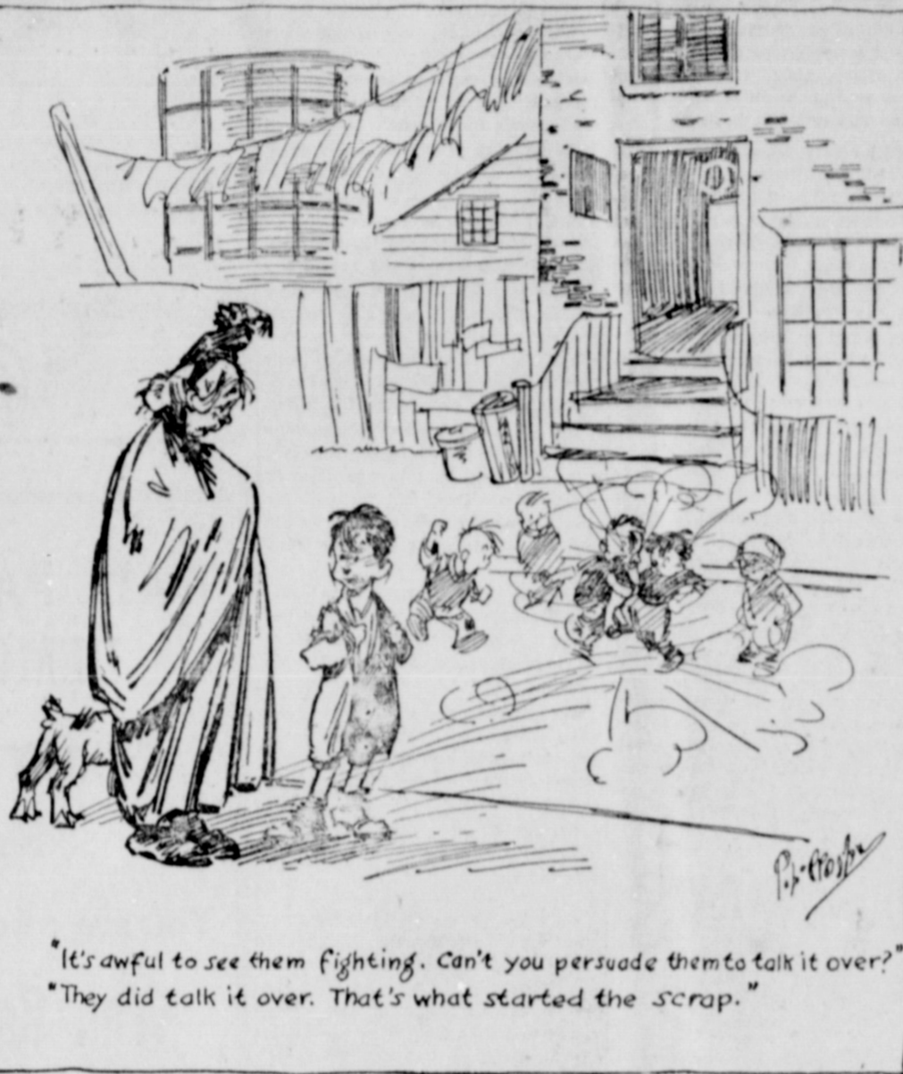
"It's awful to see them fighting. Can't you persuade them to talk it over?" "They did talk it over. That's what started the scrap."