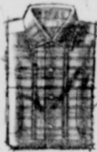
BERTRAND sportshirt — Quiet, understated plaid in soft, warm hues... exclusive Galey & Lord cotton wash and wear.