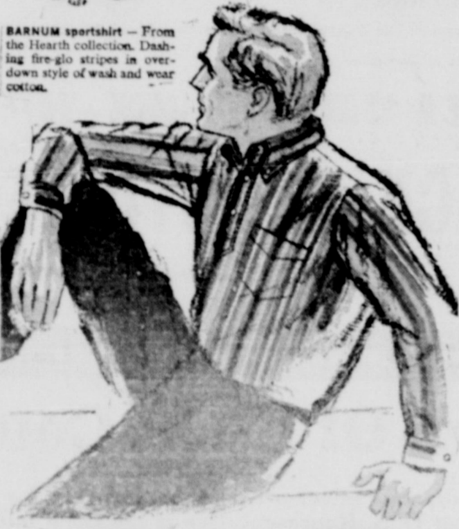
BARNUM sportshirt — From the Hearth collection. Dashing fire-glo stripes in over-down style of wash and wear cotton.

LIGHT UP HIS CHRISTMAS WITH THE WARM GLOW OF MCGREGOR