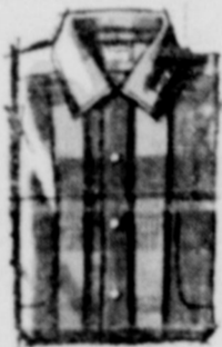
STEEPLCHASE sportshirt — High-spirited fire-glo colors in sassy windowpane plaid. Sportful wash and wear cotton.