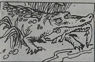
A female alligator carries her newly hatched young to water in her mouth.