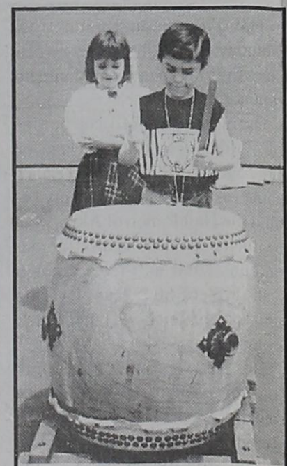
Guess what drummer is turning 16?

In a previous edition of The Munday Courier we listed an incorrect total of collections for The American Cancer Society during their recent fund raising drive. The American Cancer Society in Knox County raised a grand total of $6,665.99. Congratulations to all who helped with this worthy charity.