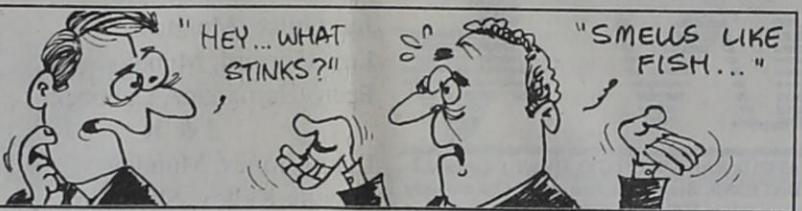
The Sacred Cod hangs over the rear of the chamber of the Massachusetts House of Representatives in Boston. The five-foot carved fish symbolizes the importance of the fishing industry in the state's early growth and development.