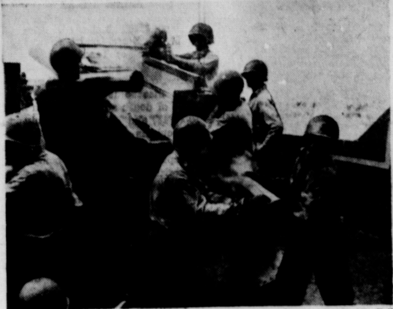
Bombarding Guam, Official U. S. Navy photograph shown at the 4th Edition of "Grafex Sees The War."