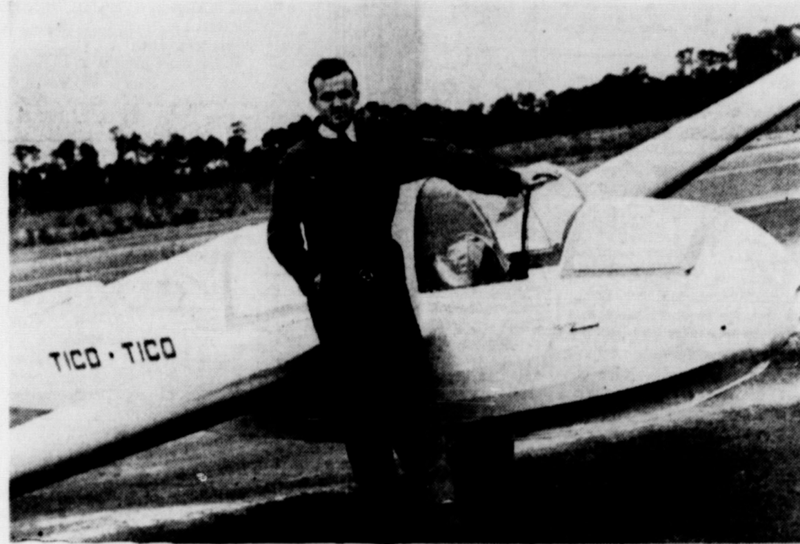
America's most daring sailplane pilot will demonstrate "aerobatics" on opening day of the 14th annual National Soaring Contest at Wichita Falls July 4. Pictured here with