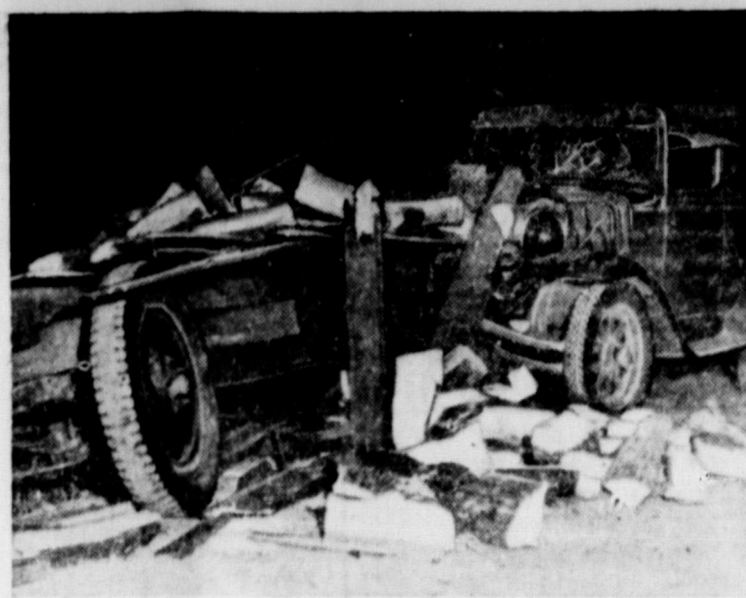
This unlighted trailer, moving slowly along the darkened highway, was completely invisible to an overtaking motorist as he came suddenly upon it from around a corner. He crashed into it and was fatally injured. Just one more of the many bitter ironies of highway deaths, where a lawbreaker who was indifferent to his own safety and the safety of others escaped injury, while an innocent victim paid for that indifference with his life.