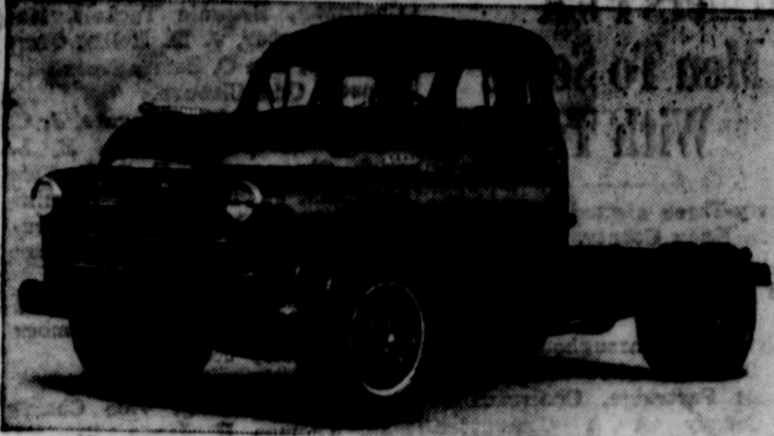
Among the 248 basic gross vehicle weight chassis models just announced in the new Dodge "Job-Rated" truck line is this B-1-H tractor of 128-inch wheelbase, 15,500 pounds gross vehicle weight (1 1/2-ton nominal rating) and 28,000 pounds gross train weight. The trucks have many new features.