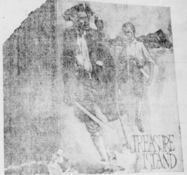
Treasure Island, 20,000 Leagues Under the Sea, Swiss Family Robinson, The Jungle Book, The Virginia Archers, Arabian Nights, Robin Hood, The Irons, Fall of the Wild, Paul Bunyan

Now! Your chance to own 99¢ Treasure Island for only