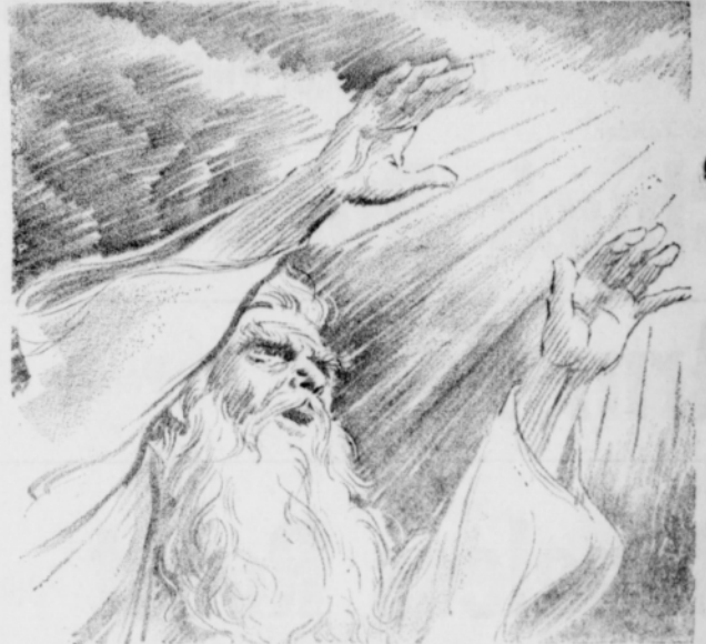
"IT WAS NOT THROUGH ANY HUMAN WILL THAT MEN PROPHECIED OF OLD; MEN THEY WERE, BUT, IMPELLED BY THE HOLY SPIRIT, THEY SPOKE THE WORDS OF GOD (1 PETER 1:10-11) (NEW ENG. BIBLE)"