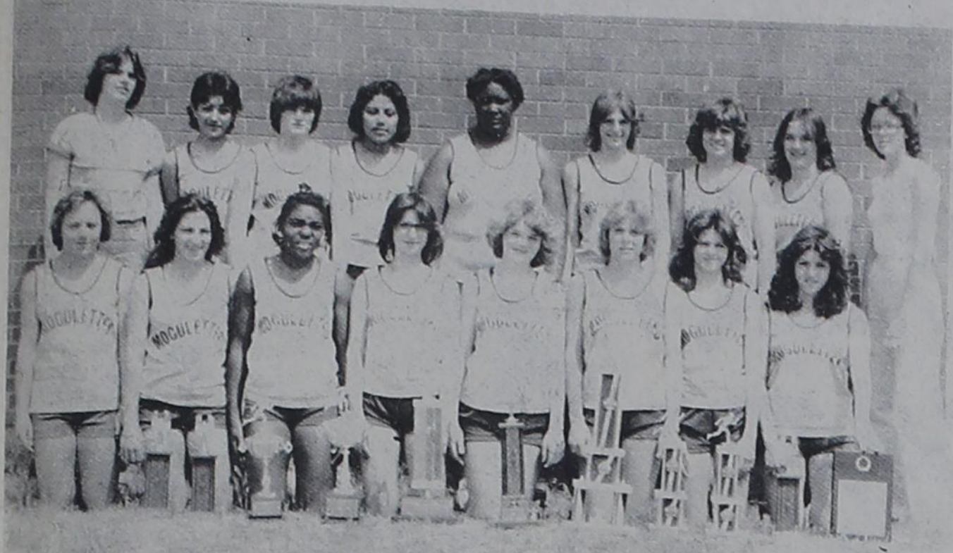
VARSITY TRACK: Seventeen members of the girls' track team, representing Munday High School, won high in the district events held at Aspermont last Friday.