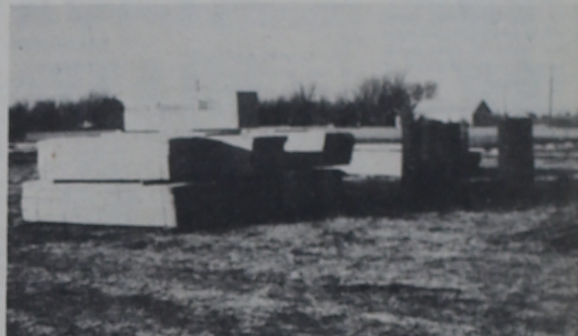
WORK BEGINS: Materials are on the site and construction work started on the new 24-unit housing complex by the Munday Home Development Corp. High Plains Builders Co. of Amarillo has the contract.