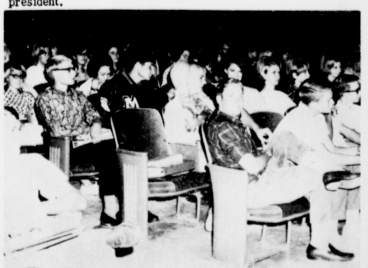
SERIOUSLY, NOW ---- Juniors take the