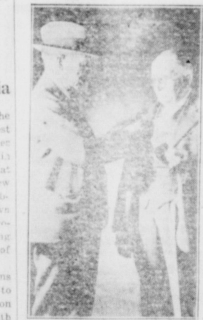
SELLS ROOSEVELT GARNER PLAQUES TO REPUBLICANS

Weather conditions during the past few weeks have been ideal for gathering the big crop and with continued favorable weather it is believed that another month will just about get the major portion of the cotton.