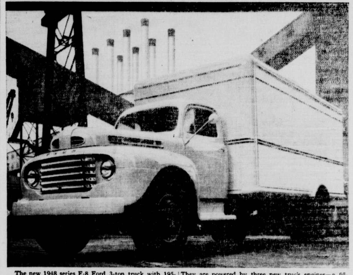
The new 1948 series F-8 Ford 3-ton truck with 195-inch wheelbase is the largest truck ever built by the Ford Motor Company. The new 1948 truck line offers a wider range of models and capacities than ever before. They are powered by three new truck engines—a 95-horsepower six-cylinder engine, a 100-horsepower V-8 and a 145-horsepower V-8.