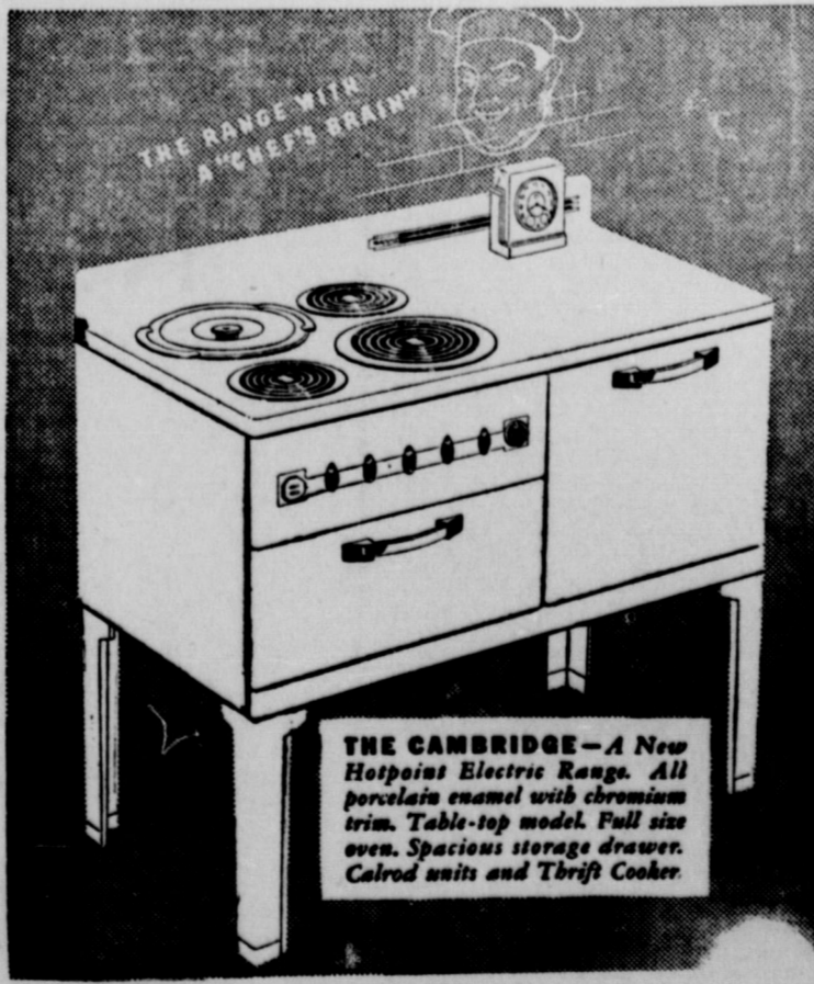
THE CAMBRIDGE—A New Hotpoint Electric Range. All porcelain enamel with chromium trim. Table-top model. Full size oven. Spacious storage drawer. Calrod units and Thrift Cooker.

Economical. Uses only about as much current as the kitchen light. Cooks an entire meal of meat, vegetables, dessert—or bakes small quantities, like a few potatoes, without need for heating up the oven.