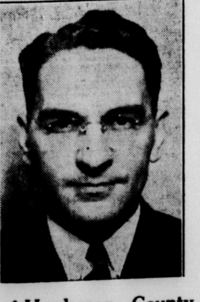
of Hardeman County

Believes in Law Enforcement, Hard Work, Economy, Justice and Fairness to All and Prosecution Without Persecution.