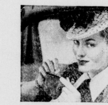
CAREFUL SHOPPER type tells you:

"I'm driving the car all day while my husband's at work, so I really buy most of the family gasoline out of my own budget. If I can get even 2 or 3 miles more to a gallon I want to know it. That's why I went to a Conoco station for my Mile-Dial—not just because it's free, but because it really lets you know your true mileage, exactly as a woman wants to really know about anything she pays for. I like buying tested things—the same as any up-to-date consumer—and this certified Mile-Dial is like giving us consumers our own easy way of testing Conoco Bronz-z-z for mileage.