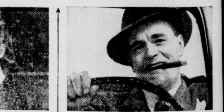
"DIDN'T CARE" type of driver says:

"Anyway, it's almost like a game, dialing your correct mileage on the Mile-Dial—awfully clever. My husband says so, too. By the way, my driving is just as economical as his, the way it proves out on our Mile-Dial. Isn't that interesting? And we're keeping on dialing to make sure of our average in all different driving. Right now, after 61 gallons of Bronz-z-z in all, we're a good 200 miles ahead of what we used to expect from that much gasoline."