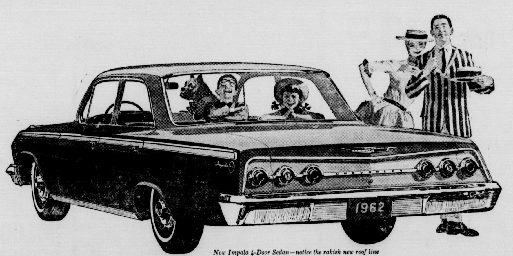
New Impala 4-Door Sedan—notice the rakish new roof line