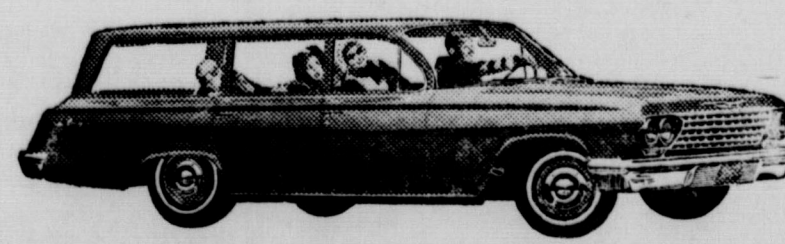
New Biscayne 4-Door 6-Passenger Station Wagon—lots of room and zoom