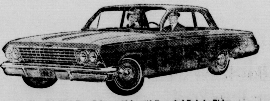
New Bel Air 2-Door Sedan—with beautifully crafted Body by Fisher

See the '62 Chevrolet, the new Chevy II and '62 Corvair at your local authorized Chevrolet dealer's