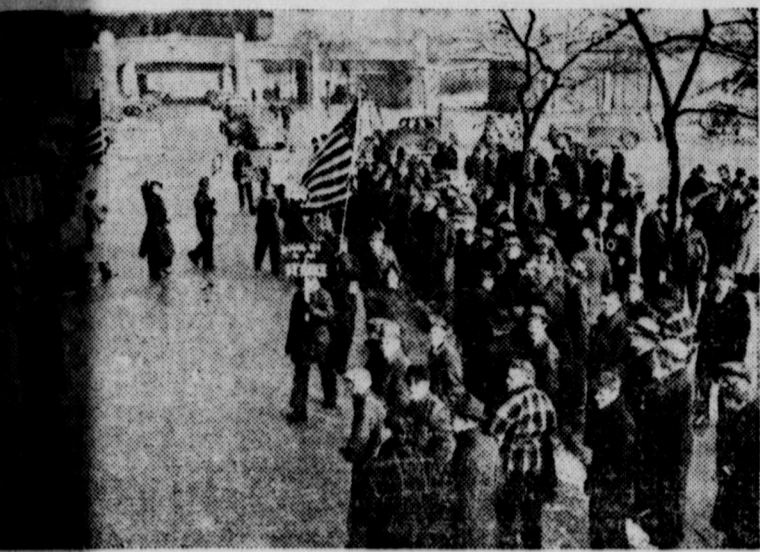
Pickets outside the plant of the International Harvester company, in Chicago, where a strike of C.I.O. workers affected some 6,000 workers of tractor works, and tied up United States orders for defense materials. The demands made by the union were a minimum wage of 75 cents an hour and compensation for army selectees.