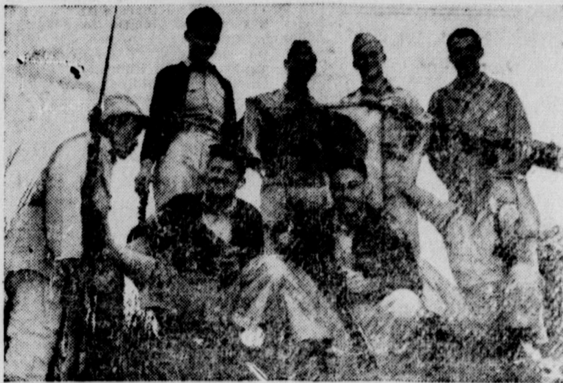
A few of the fighter pilots of the 14th U. S. air force in China who broke up a big force of Jap bombers attempting to destroy the 14th's air field. The total enemy loss was 15 bombers and 2 Zeros confirmed, 7 bombers and 2 Zeros probably destroyed, and 3 bombers and 4 Zeros damaged. The raid was attempted on Japan's "aviation day."

Nice end tables, only $1.49 each at Beverly Hardware and Furniture Co.