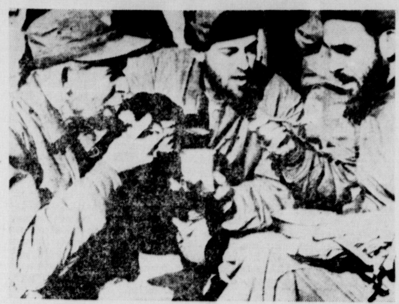
NEW YORK, N. Y .- This photo, distributed by "Eastfoto," is described as "American prisoners in Korea." It is one of the few pictures that trickle from behind the iron curtain, possibly because the communist powers believe it advantageous.