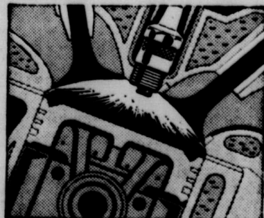
Hemispherical Combustion Chambers the engineering reason why no other American passenger car engine today can match FirePower performance.