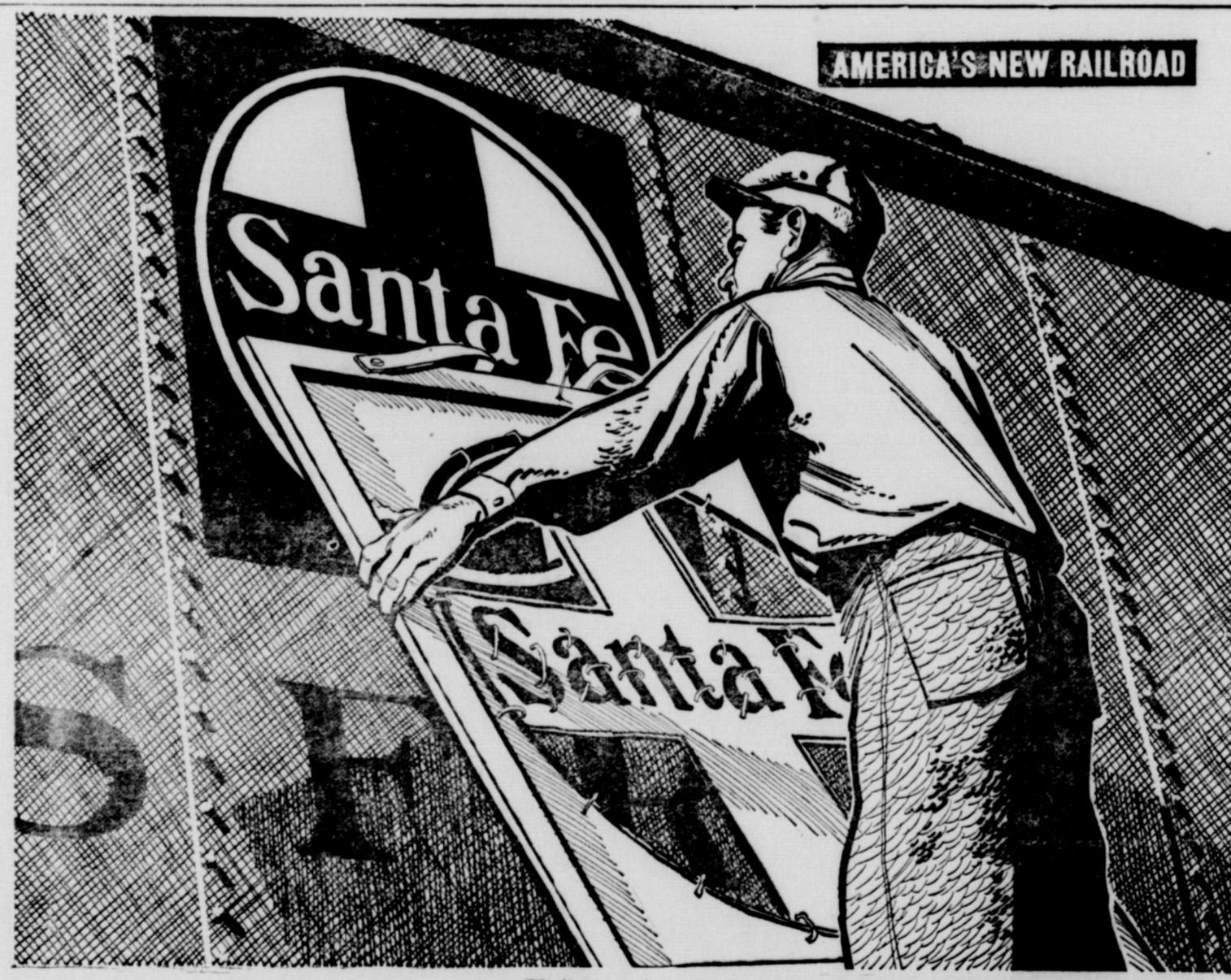
The "stamp of newness"—and another new Santa Fe freight car is ready to roll

Waterfowl Shooting Regulations Named Only two changes from last year mark the new waterfowl regulations, according to the Executive Secretary of the Game and